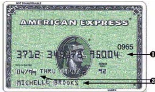
Figure 4-5. Example of Fraudulent Embossing

Characteristics of fraudulent Embossing include: