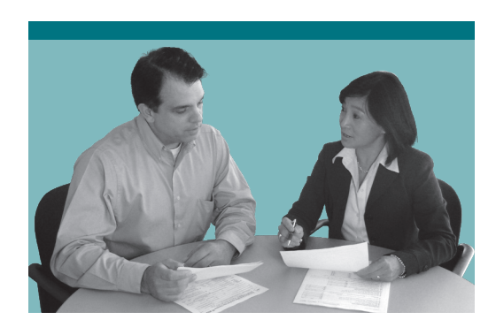
TR-24 (8/15) (back)

If you are unable to pay your tax debt in full, you may be able to set up a payment plan. Use your Online Services account or call us at (518) 457-5434 to learn more.